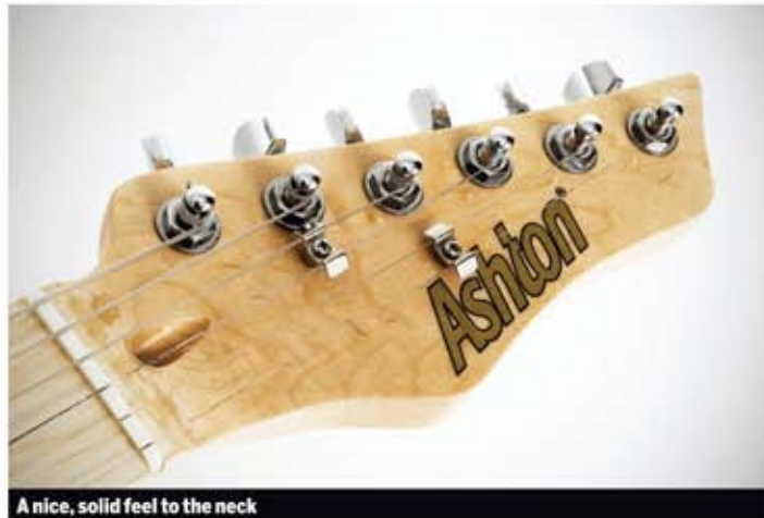
A nice, solid feel to the neck

the music as well as hear it. The Fidelity has no real surprises in its electronics. For the price, we weren't expecting the richness of a classic Tele but there's enough to satisfy most people. The bite and power of the bridge pickup is all there, enough to drive the front end of your amp in a solid way. It doesn't have the upper-mid honk that other brands might have but there's plenty of juice to make up for it. The neck pickup has that nice, almost hollow, sweetness that is as much at home with jazz as rock or pop. This pickup backs off nicely for clean sounds and rolled-off jazzy tones. Would you use this guitar for jazz? Absolutely and remember that its ancestor was created in the late '40s, before rock and roll, when jazz and country were the prevailing styles.