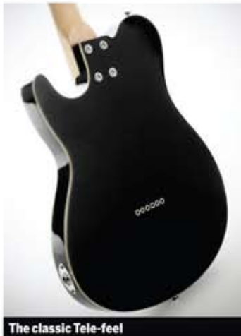
The classic Tele-feel